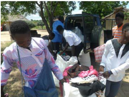
Clothes being unloaded from the ministry car

We decided to ask for used clothes and shoes of all sizes for men, women and children. We collected, cleaned and donated. This year we had two of these clothing drives. We wait to collect enough and then go to the places of need with them. We still have some clothes and we are praying for more.