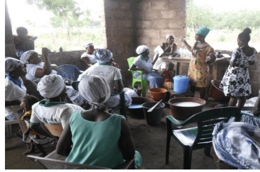
Women learning how to make soap, talcum powder and bleach

We had requests for additional training, but we did not have enough funding to do more training. We hope to do more in 2020.