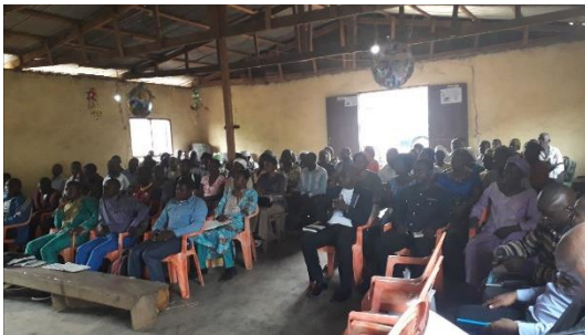
Baptist Pastors/leaders of the Western Region of Cameroon