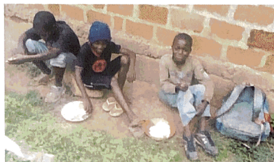
For I was hungry and you gave me something to eat. Matthew 25:35