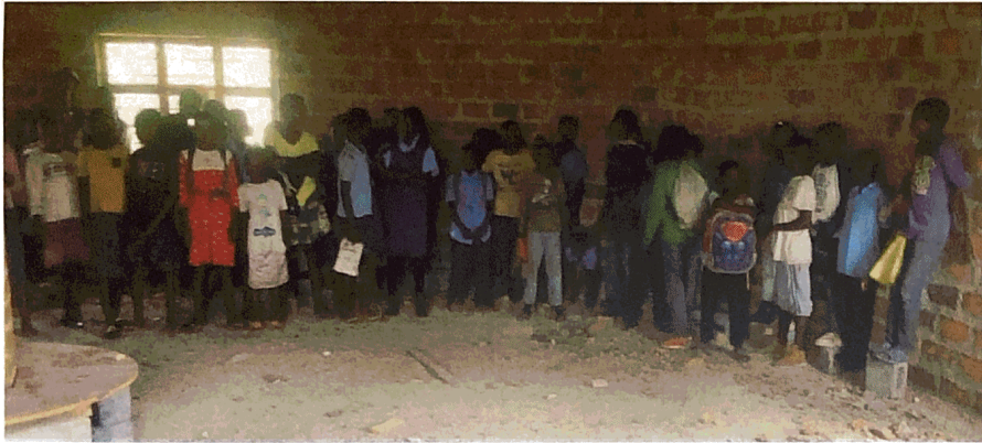
Children assembling for chapel in the new building. Chapel being finished with a cross installed at the peak.