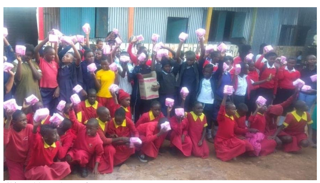
Girls receiving sanitary pads