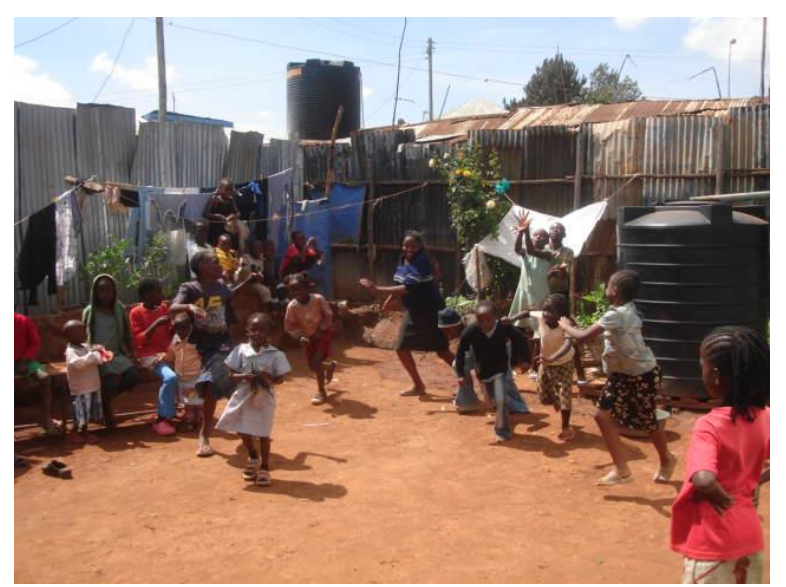
Playing after VBS