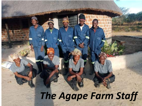
The Agape Farm Staff

Beautiful faces of Children's Ministry and Agape Farm – please keep these people in your prayers as they serve!