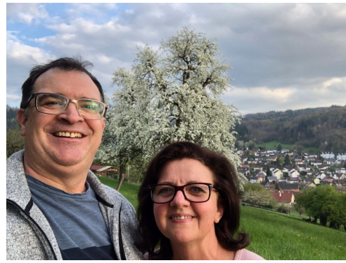
Love our walks above our town.