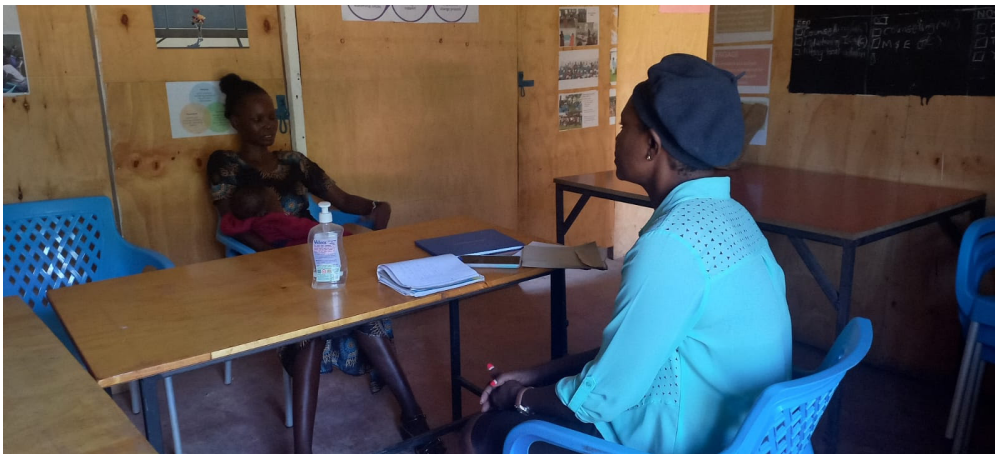
Counseling session with a para social worker in August 2023

The challenges we face are immense, and the stories of survivors we encounter touch our hearts deeply, reinforcing the urgency and importance of our work at IFAGE. GBV is a stark reality for countless individuals, and we firmly believe that only together can we eradicate this menace.