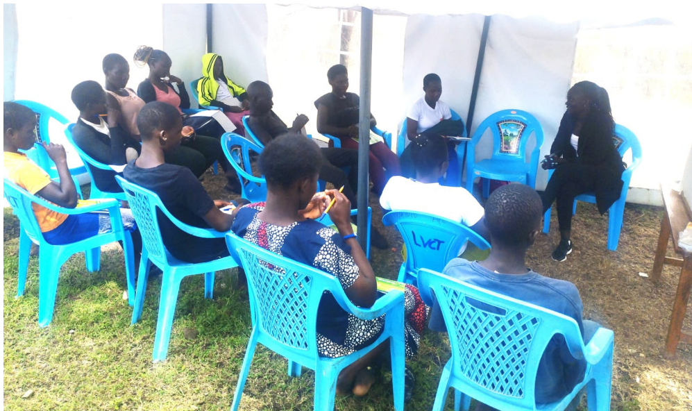
IFAGE counselor talking to a group of survivors traced by our Gender Champions from January 2023

In this August update, we are proud to share with you some of the impactful initiatives we've undertaken: