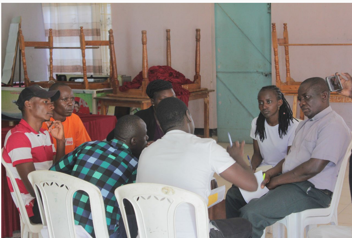
Youth Friendly Health Care Providers & faith leaders having a discussion on Sexual Reproductive Health for Adolescents and Youths in Rarieda Sub-county on 9th April 2023

IFAGE held a sensitization training on adolescents and youth-friendly health services at St. Paul's Ranalo Church, from May 9th to 10th, 2023.