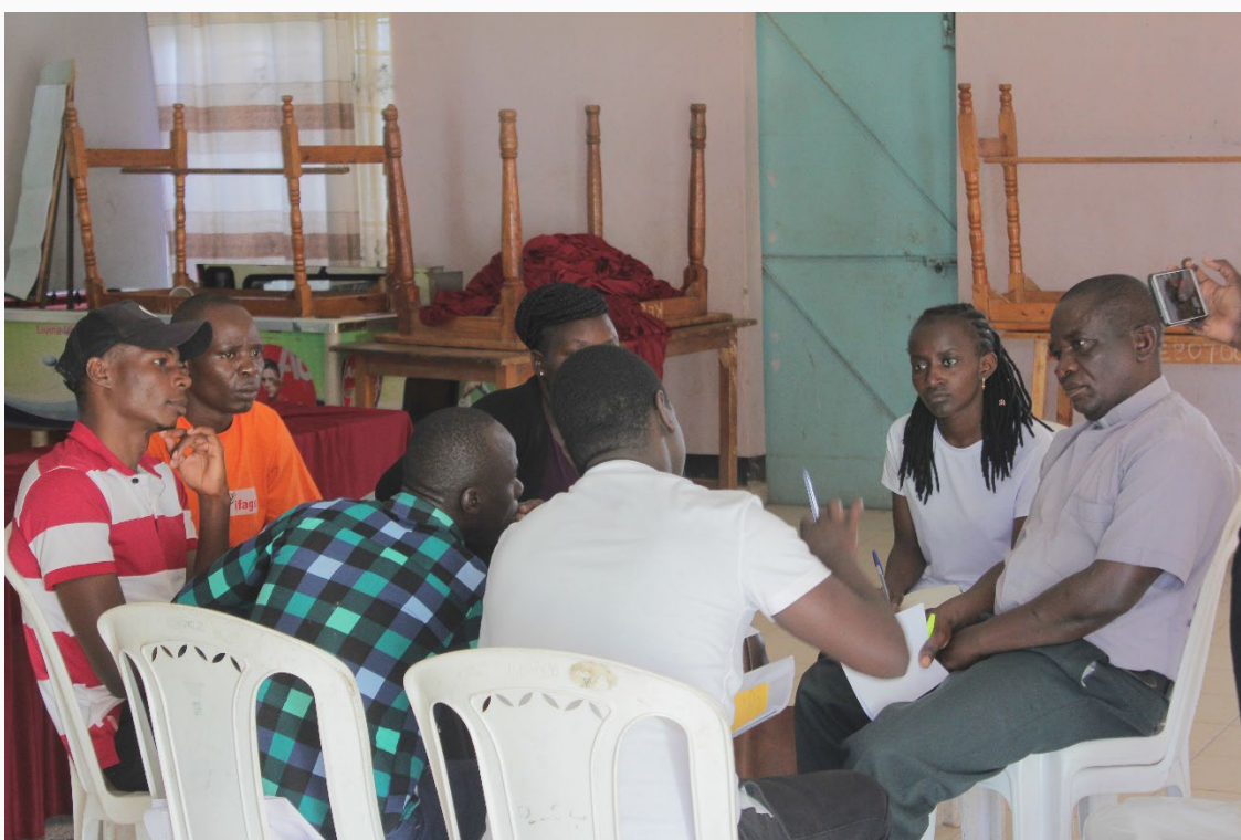
Youth Friendly Health Care Providers & faith leaders having a discussion on Sexual Reproductive Health for Adolescents and Youths in Rarieda Sub-county on 9th April 2023

IFAGE held a sensitization training on adolescents and youth-friendly health services at St. Paul's Ranalo Church, from May 9th to 10th, 2023.