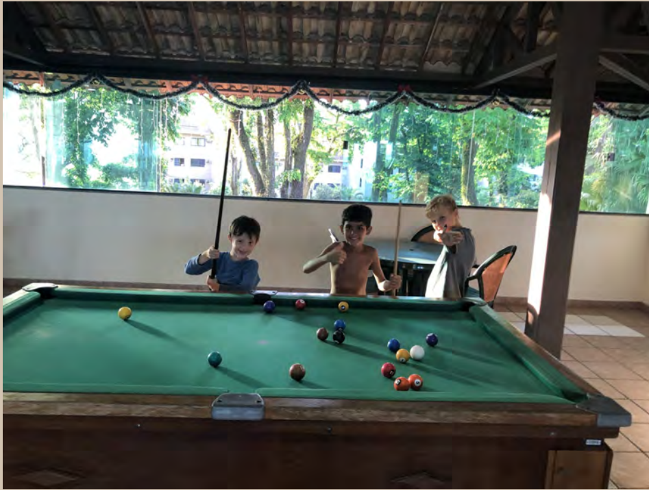
Making friends everywhere they go