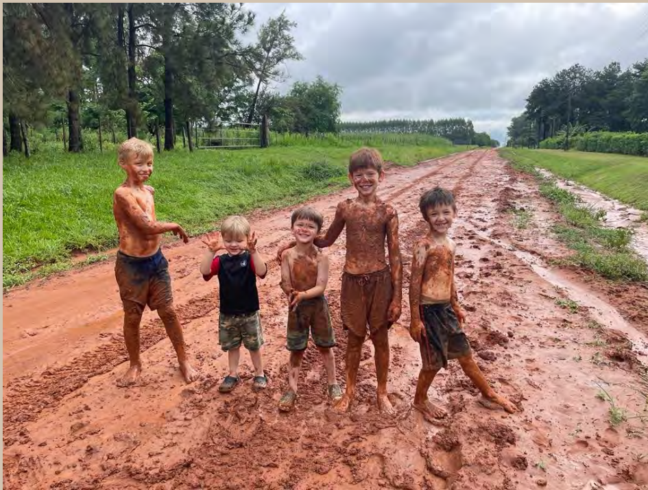
Mudding- Paraguayan style!