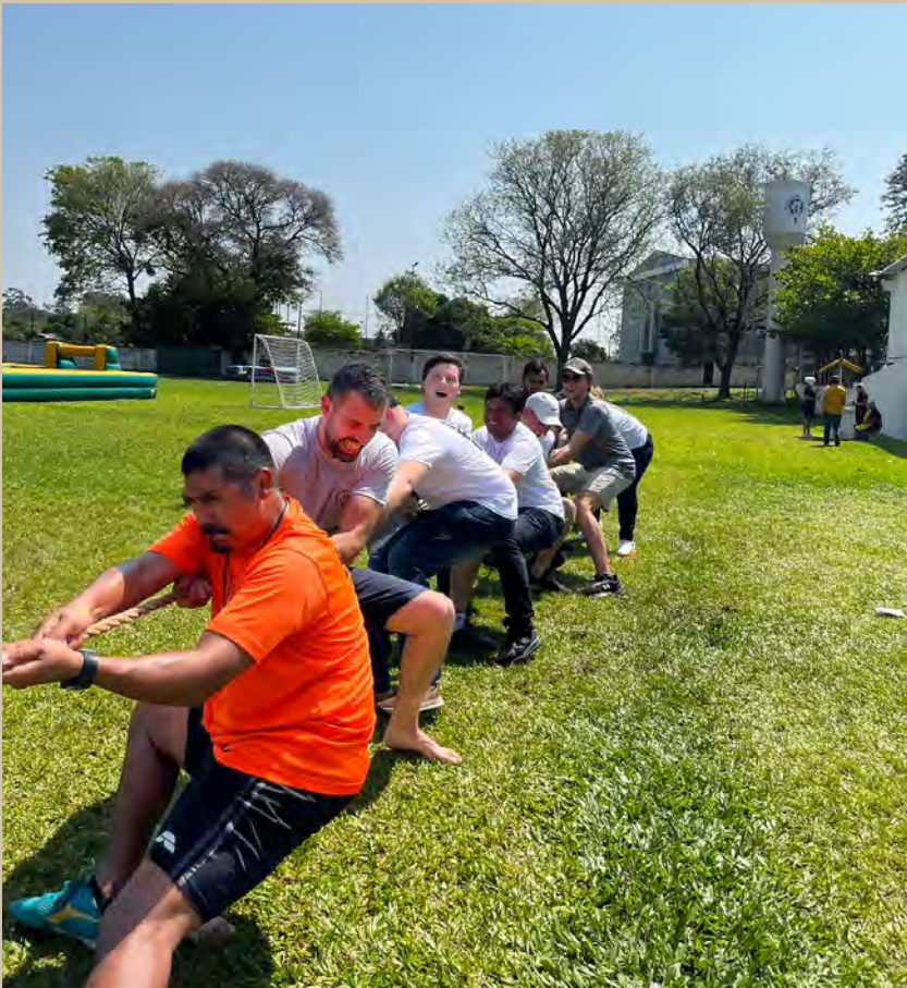
Teachers versus students tug of war at ACA