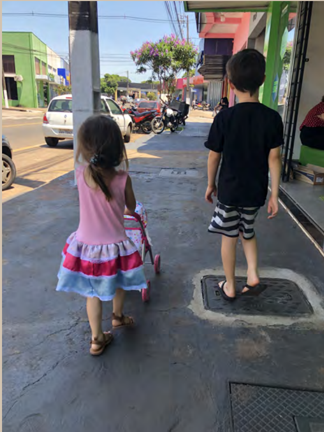
Walking the streets of Brazil