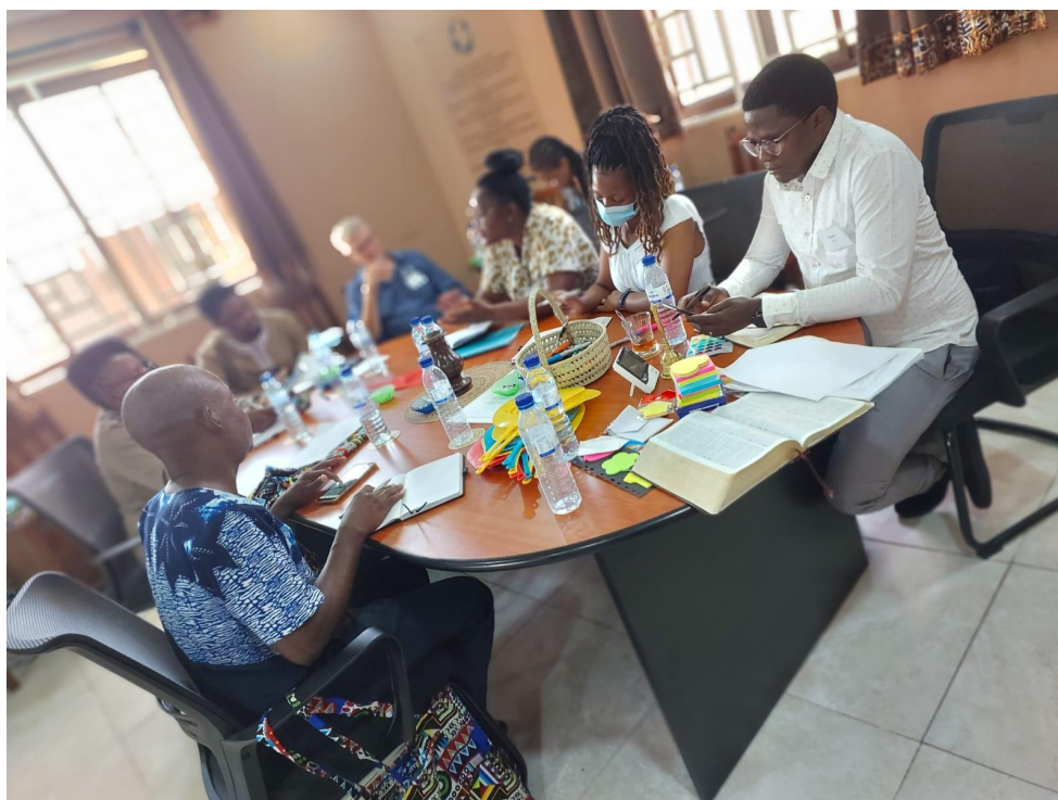
The MCC-Mozambique in a group discussing; common positive masculinity traits that can promote gender equality

Through these conversations, IFAGE strives not just to educate but to inspire a paradigm shift. By challenging preconceptions and providing a platform for open dialogue, we aim to shape a future where equality is a shared value and women and men are free from gender based violence.