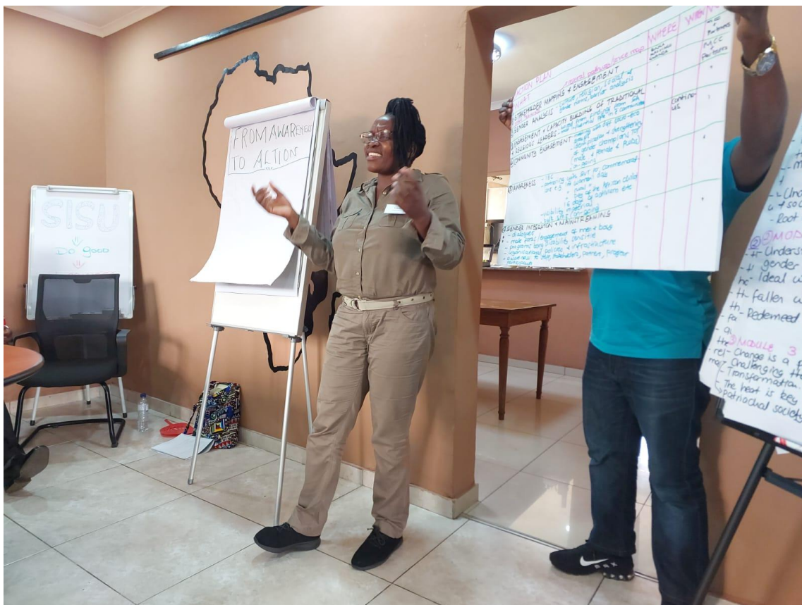
Delegates from Nigeria presenting their action plan on 11 th Jan 2024 at the MCC-Mozambique training

This ignited an unwavering desire within IFAGE to amplify our efforts. We are committed to scaling up our initiatives and spearheading the establishment of a robust Side by Side faith movement for gender equality and justice.