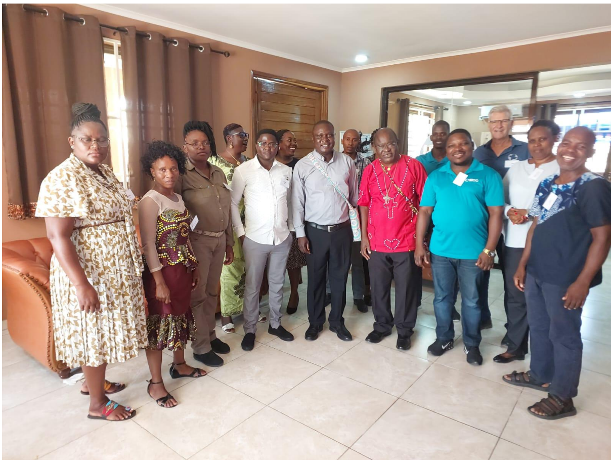
The MCC-Mozambique group photo during a break from sessions on 10 th Jan 2024 at Beira, Mozambique.

This year holds promise, and our recent training signifies a step towards positive change and empowerment.