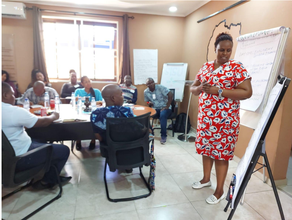
A delegate giving a group presentation after the group discussion on positive masculinity

IFAGE remains dedicated to its vision of transforming communities by empowering women and fostering gender equality. The journey continues, and as we navigate the year 2024, we do so with a renewed sense of purpose, confidence, and unwavering commitment to being agents of positive change. The ripple effects of these discussions are bound to create lasting impacts in communities and contribute to a future of true equality and justice.