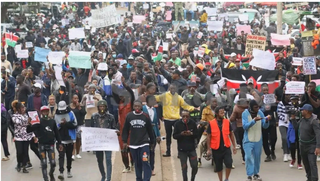
Pictures of Gen Z on the streets during the Reject Financial Bill 2024 protest

Despite the peaceful demonstration by the Gen Z's as guaranteed by chapter four of the Kenyan Constitution, also known as the Bill of Rights. Specifically, Article 37 guarantees the right to assembly, demonstration, picketing, and petition. It states: " Every person has the right, peaceably and unarmed, to assemble, to demonstrate, to picket, and to present petitions to public authorities. The government's response has been marked by a heavy-handed approach, there have been numerous incidents of police brutality. This has led to several deaths and injuries among protesters, whose only mistake was to come out and condemn the Government on the heavy taxes, the rising cost of living, and government accountability.