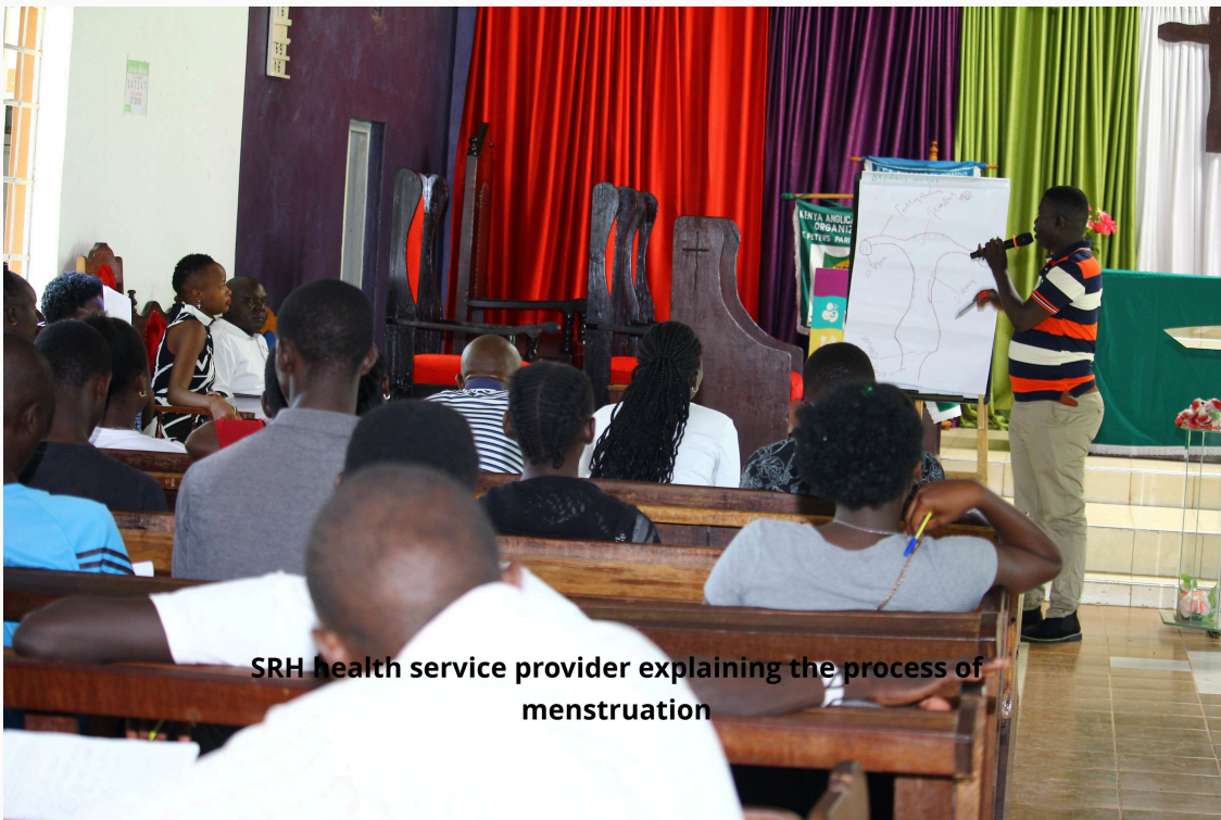
SRH health service provider explaining the process of menstruation

As part of our follow-up activities with religious leaders after the Intersectional, See, Judge, and Act Tool (ISJA) training, we joined St. Peter's Nyamira Youth, a safe space that was created following an interdenominational dialogue where action plans were developed to address sexual and reproductive health (SRH) issues within faith communities. During this event, we distributed sanitary pads and innerwear, and engaged the youth in discussions about menstrual health, aiming to dismantle myths and promote a more supportive environment for menstrual hygiene management.