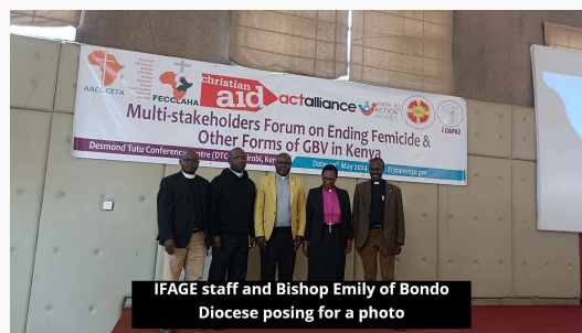
IFAGE staff and Bishop Emily of Bondo Diocese posing for a photo