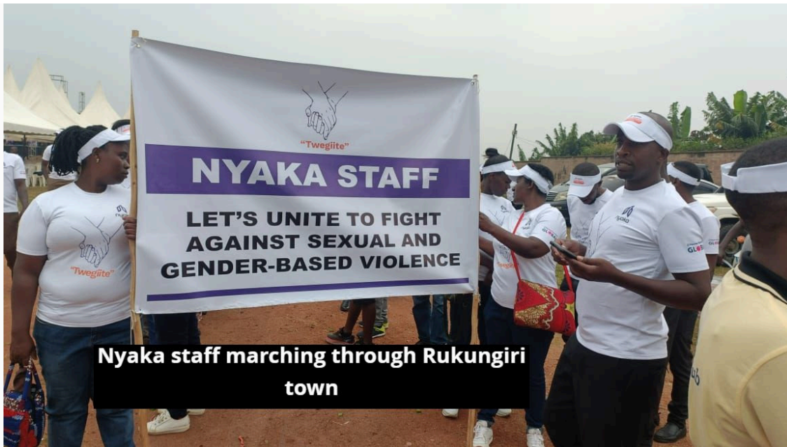
Nyaka staff marching through Rukungiri town