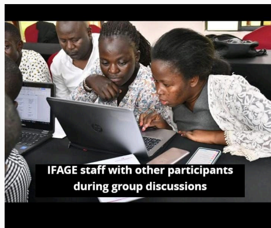
IFAGE staff with other participants during group discussions