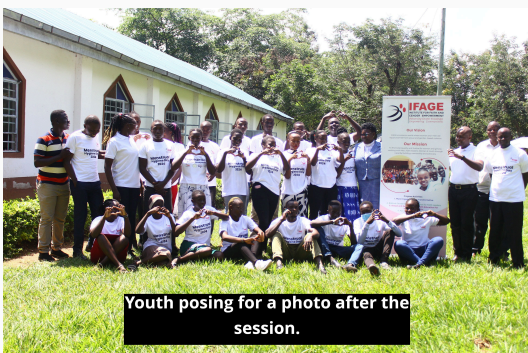
Youth posing for a photo after the session.