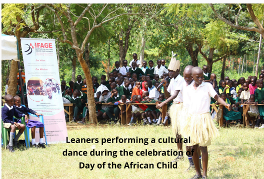
Learners performing a cultural dance during the celebration of Day of the African Child