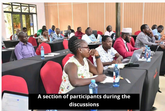
A section of participants during the discussions

The gathering emphasized the importance of using data-driven, evidence-based interventions, and capacity-building for teachers to ensure the effectiveness of these initiatives. The implementation matrix discussed during the meeting will guide the county in achieving its goal of zero incidence of the triple threat among the youth population.