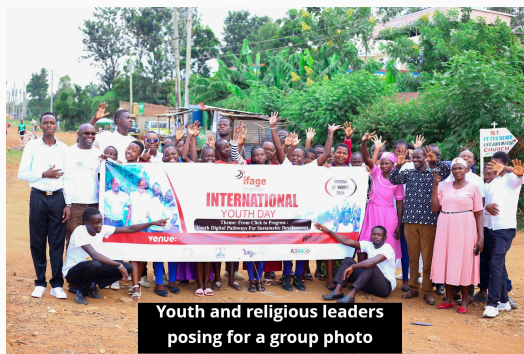
Youth and religious leaders posing for a group photo