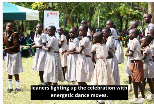
learners lighting up the celebration with energetic dance moves.

IFAGE Beneficiaries played a significant role in providing support and words of encouragement to boys and girls in school, their involvement was instrumental in uplifting the spirits of children and providing them with hope for a brighter future. They shared their personal stories of overcoming challenges and emphasized the importance of education, resilience, and determination.