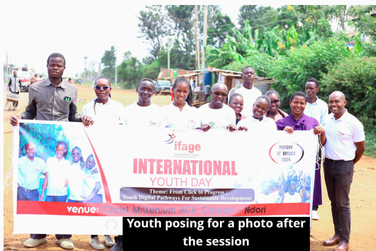
Youth posing for a photo after the session

The panel, moderated by IFAGE's SRH Coordinator, included a religious leader, a reproductive health coordinator, and a digital facilitator. The religious leader emphasized the need for faith-based organizations to more actively engage in SRHR education, addressing challenges like cultural taboos and the importance of including SRH topics in church activities. The Sub-County reproductive health coordinator discussed gaps in SRHR services, such as myths and poor health-seeking behavior, and shared successful initiatives like youth-friendly services in health facilities. The Ajira facilitator highlighted the effectiveness of digital tools, including social media platforms, messaging apps, and educational resources, in advancing SRH advocacy. The event demonstrated the potential of combining digital and faith-based strategies to enhance SRH access and advocacy, underscoring the importance of collaboration and innovative approaches in supporting youth.