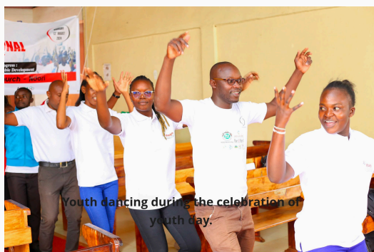
Youth dancing during the celebration of youth day.

The panel, moderated by IFAGE's SRH Coordinator, included a religious leader, a reproductive health coordinator, and a digital facilitator. The religious leader emphasized the need for faith-based organizations to more actively engage in SRHR education, addressing challenges like cultural taboos and the importance of including SRH topics in church activities. The Sub-County reproductive health coordinator discussed gaps in SRHR services, such as myths and poor health-seeking behavior, and shared successful initiatives like youth-friendly services in health facilities. The Ajira facilitator highlighted the effectiveness of digital tools, including social media platforms, messaging apps, and educational resources, in advancing SRH advocacy. The event demonstrated the potential of combining digital and faith-based strategies to enhance SRH access and advocacy, underscoring the importance of collaboration and innovative approaches in supporting youth.