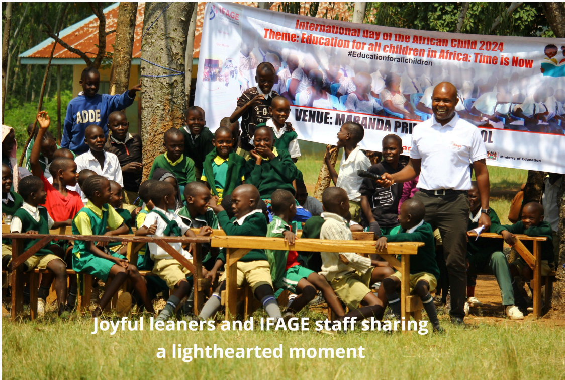
Joyful learners and IFAGE staff sharing a lighthearted moment