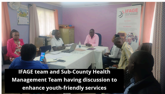
IFAGE team and Sub-County Health Management Team having discussion to enhance youth-friendly services

underscores IFAGE's commitment to leveraging partnerships and resources to drive meaningful change in SRHR service delivery.