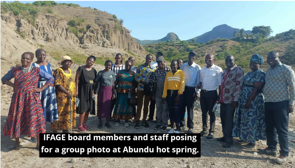
IFAGE board members and staff posing for a group photo at Abundu hot spring.