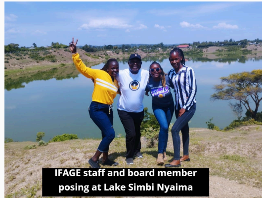
IFAGE staff and board member posing at Lake Simbi Nyaima

We are so grateful for support from our partner Imago Dei fund. Each year they give us opportunity to be together in a manner that keeps the fire burning as we explore meaning in team building and searching our inner self.