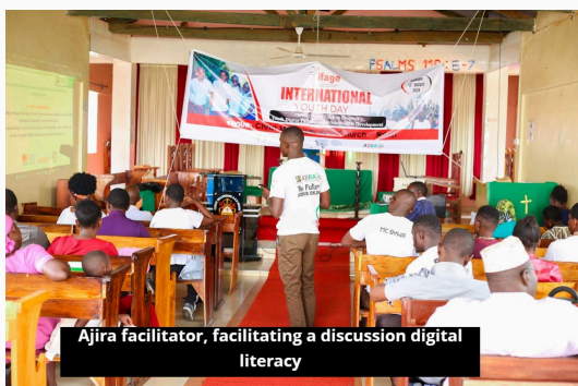
Ajira facilitator, facilitating a discussion digital literacy

On August 12th, IFAGE, in partnership with Ajira Digital, celebrated International Youth Day with the theme “From Click to Progress: Youth Digital Pathways for Sustainable Development.” This impactful event highlighted the intersection of digital technology and faith-based approaches in advancing sexual and reproductive health (SRH) for youth. The program featured a digital literacy workshop, an engaging panel discussion, and interactive sessions.