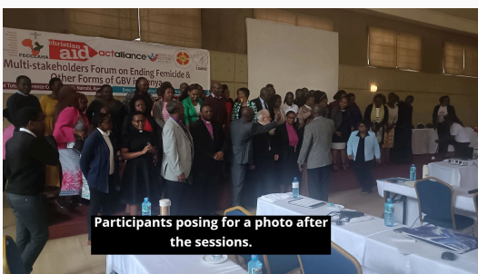
Participants posing for a photo after the sessions.

IFAGE staff members, including our Team Leader, attended a multi-stakeholder conference organized by Christian Aid Kenya and other partners. As a key panelist, our Team Leader highlighted the root causes of femicide and GBV, emphasizing the need for collective action to combat these issues. The conference provided a platform for discussing strategies to prevent femicide and promote gender justice across Kenya. Our involvement reinforces IFAGE's commitment to advocating for systemic changes that protect the rights and lives of women and girls.