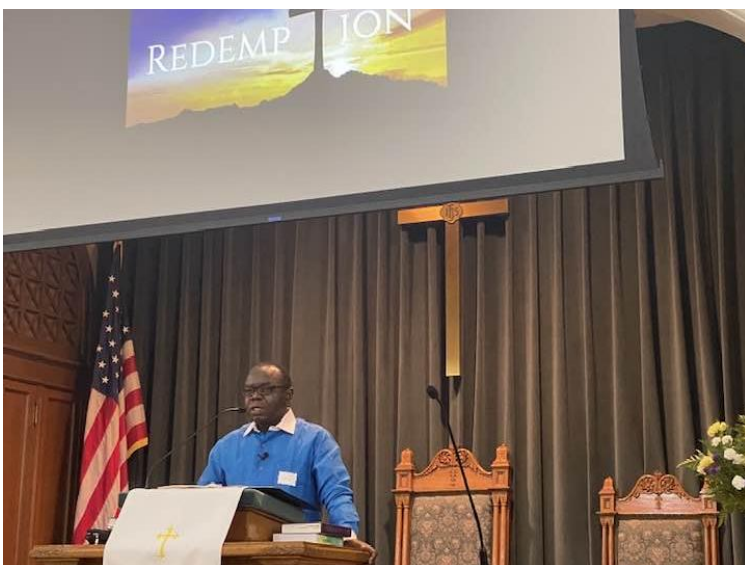
Cephas proclaiming the Gospel in south-eastern PA