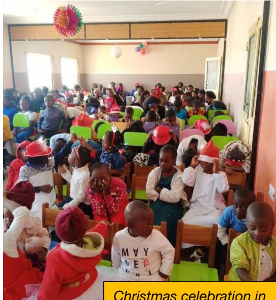
Christmas celebration in action at Hesed Academy