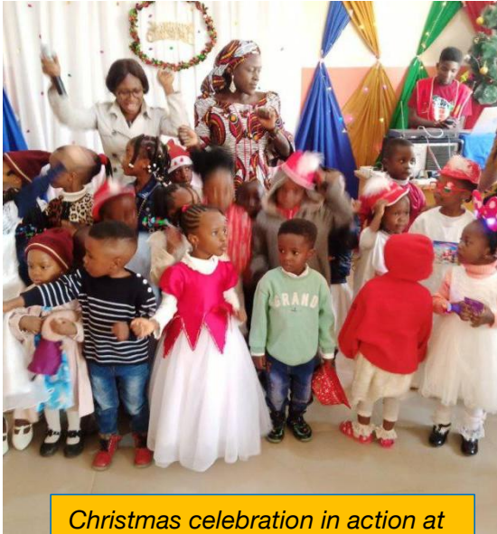
Christmas celebration in action at Hesed Academy