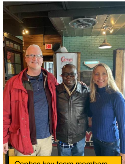
Cephas key team members at GHI Hqtrs.