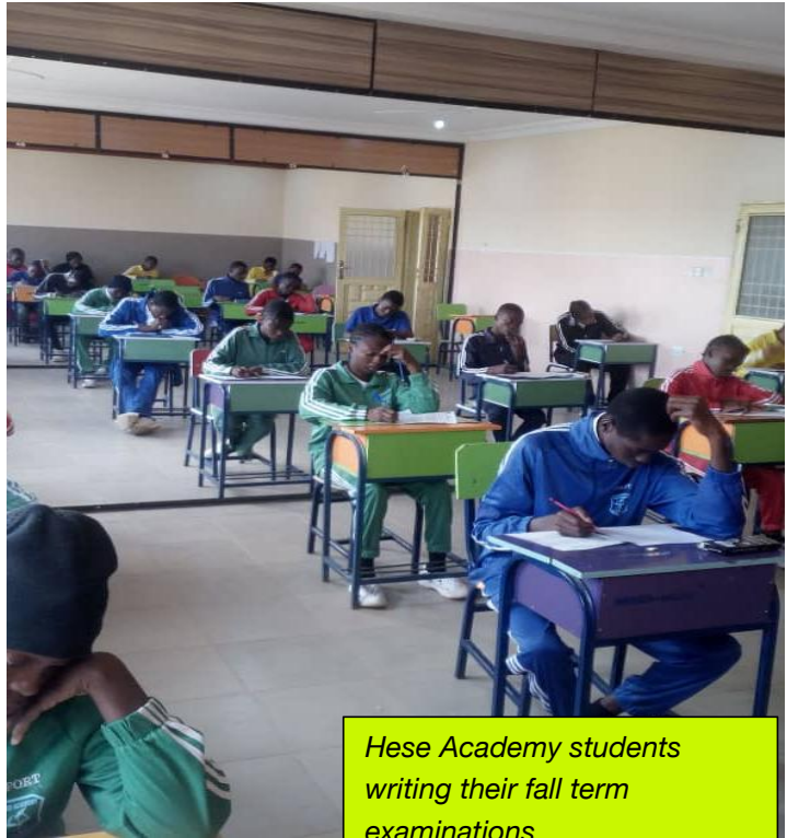
Hesed Academy students writing their fall term examinations.