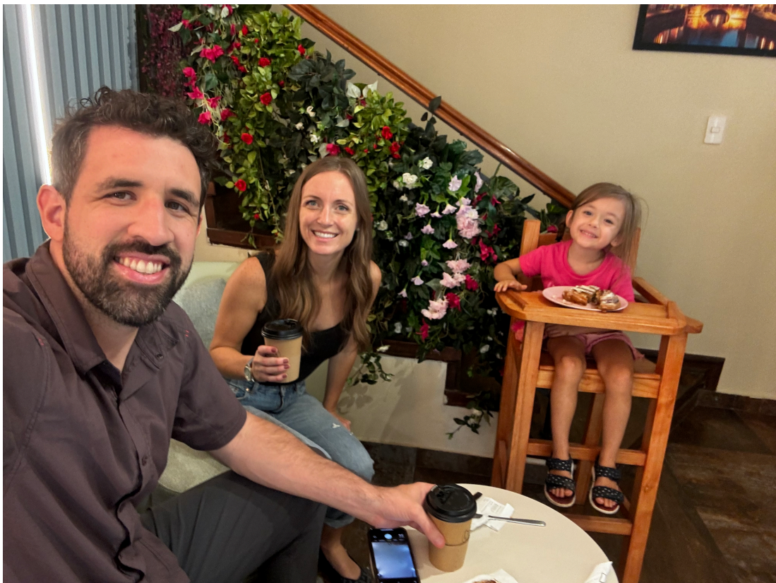
We celebrated our 12th anniversary in July. God blessed us with an extra measure of connection this year 🥰