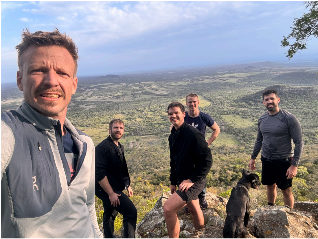
Good friends and a good view!