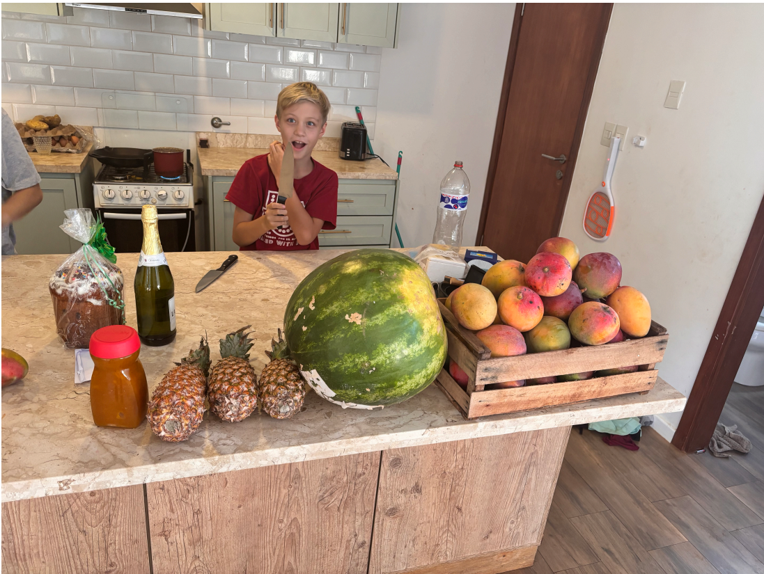
The fruit: One of our favorite parts of living here!