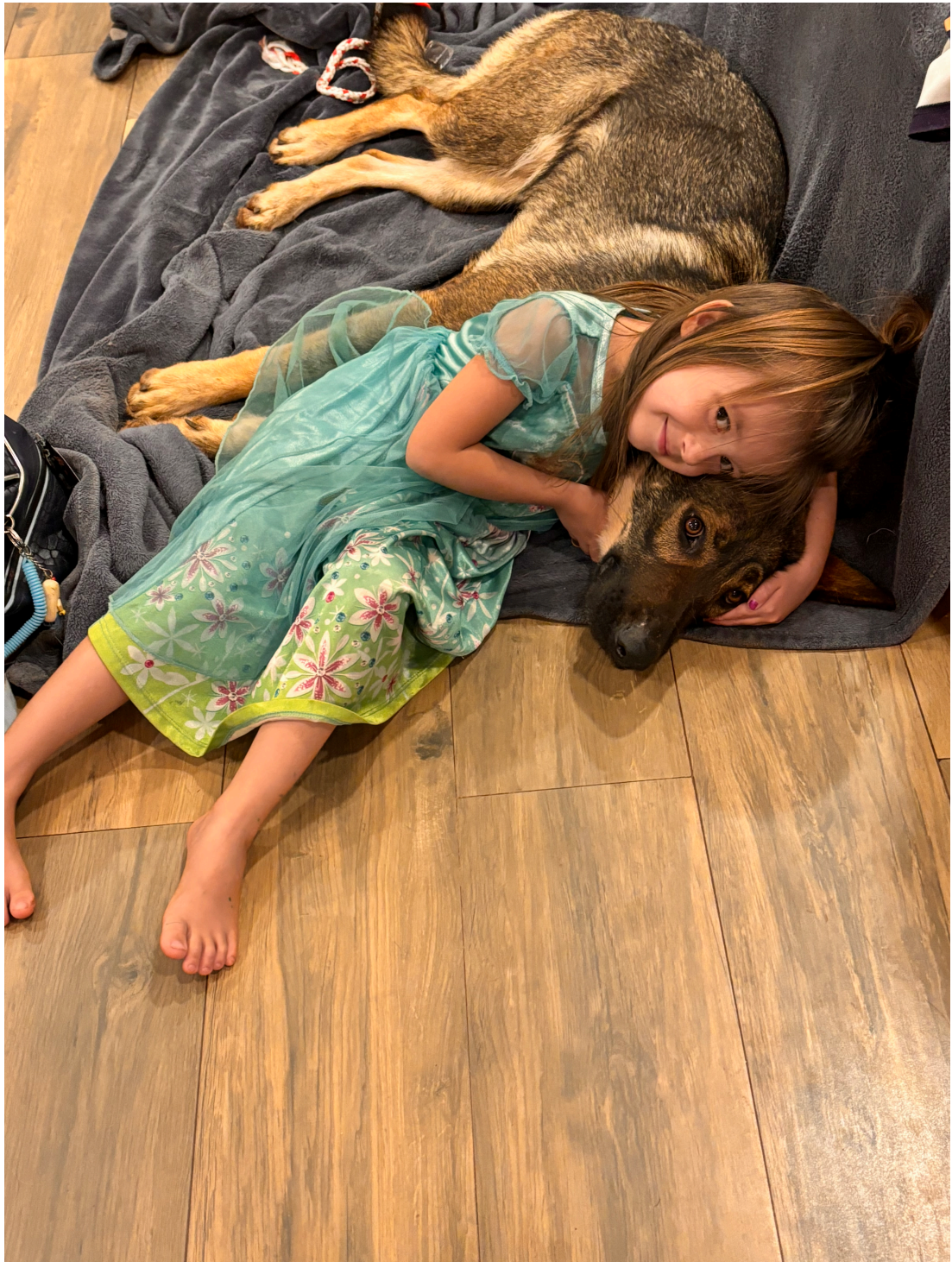
We love Carmela! 🐶