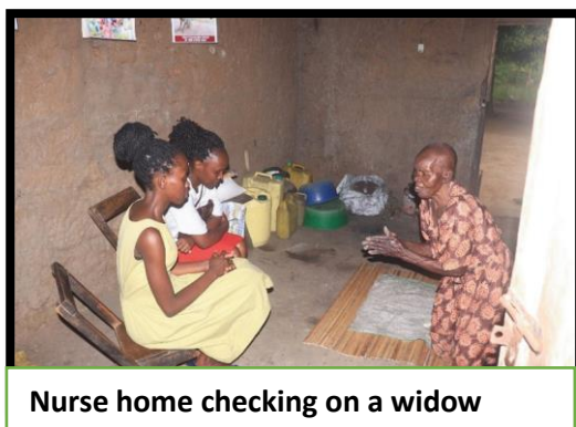
Nurse home checking on a widow

These essential care services are the heart of our program, providing vital support to widows in need. To sustain these efforts, we raise $3,500 per year and we'd be grateful for your help.