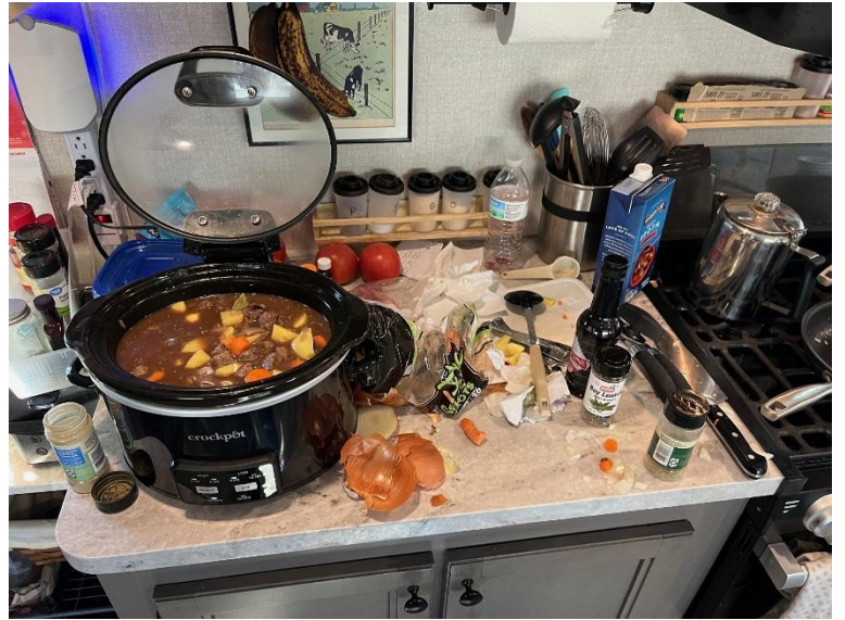
Beef stew that I made and shared