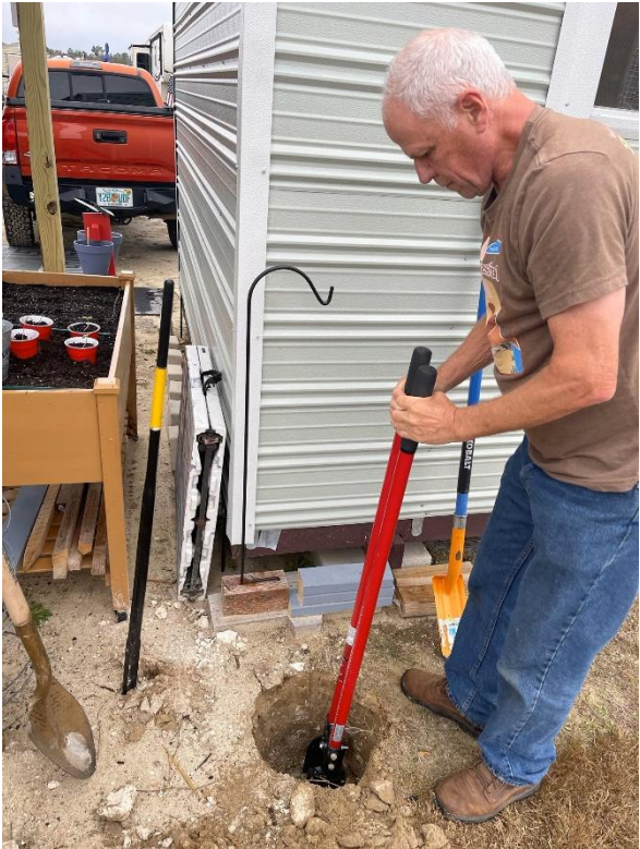
First time using a post hole digger