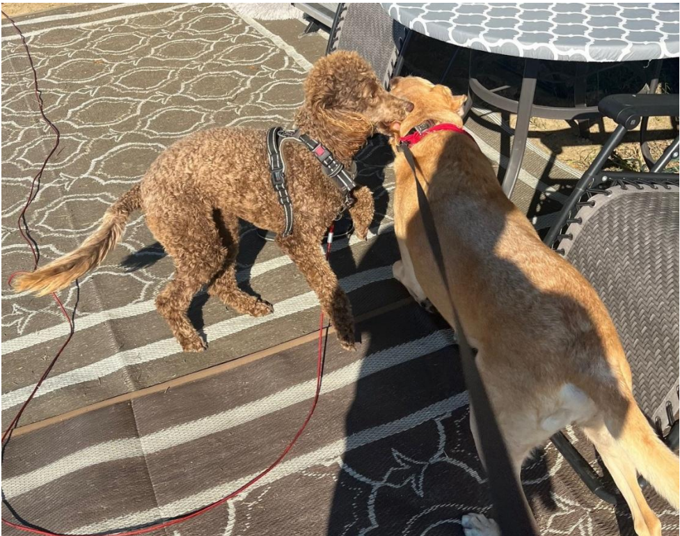
Hunter's girlfriend Sage