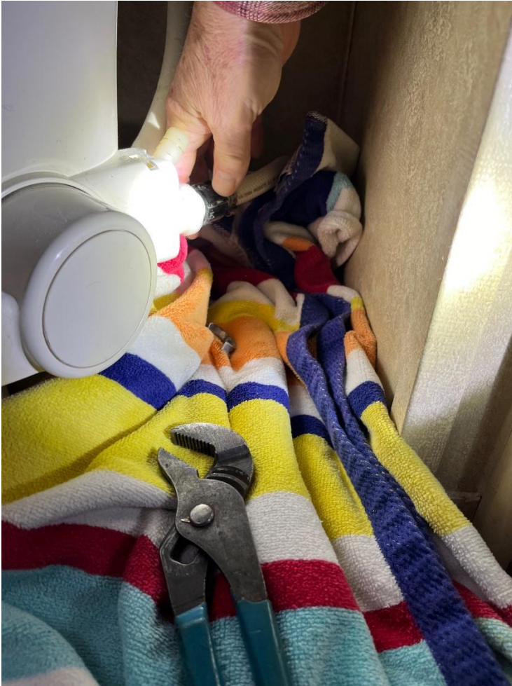
Tight quarters to get at the toilet repair