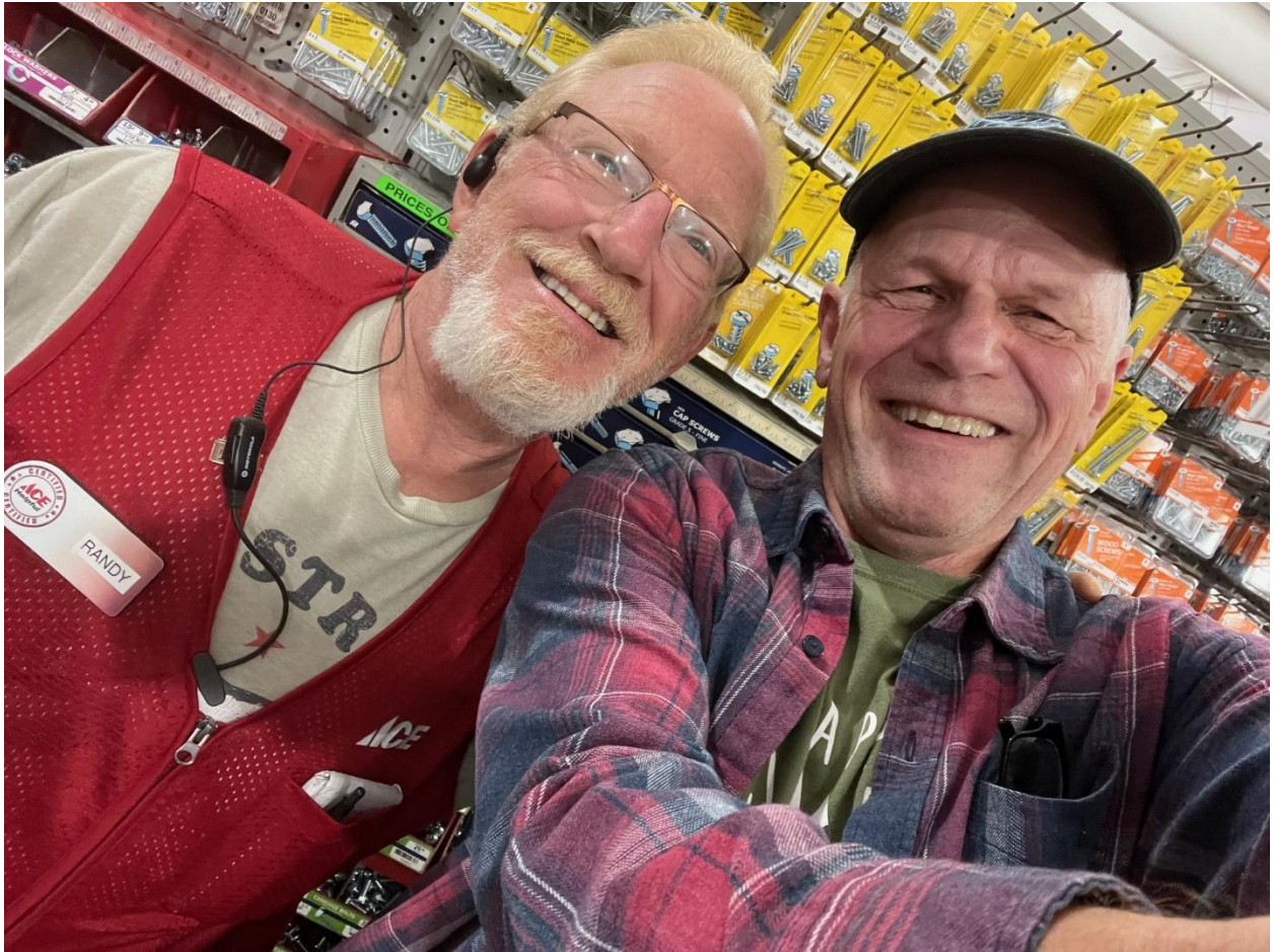
My old neighbor from Farmington