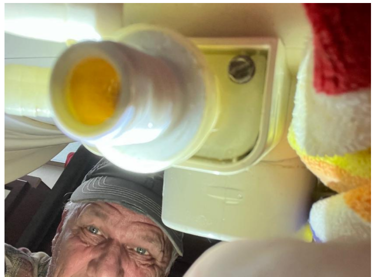
I had to use my camera to see the screws in the back