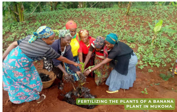
FERTILIZING THE PLANTS OF A BANANA PLANT IN MUKOMA.

Together, they grow bananas, cassava, beans, soy, vegetables, and coffee on the land of Iriba Shalom Rwanda—often under simple conditions, but with great perseverance and a strong sense of community.