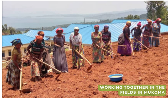
WORKING TOGETHER IN THE FIELDS IN MUKOMA

For many widows, especially in rural areas such as those served by our partner organization Iriba Shalom Rwanda in Mukoma-Shangi, agriculture remains a path back to life. After the traumatic experiences of the genocide, cultivating the fields means not only providing food, but also healing, community, and a renewed future.