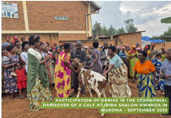
PARTICIPATION OF DENISE IN THE CEREMONIAL HANDOVER OF A CALF AT IRIBA SHALOM RWANDA IN MUKOMA – SEPTEMBER 2025

For many widows, livestock is more than material support—it is a symbol of dignity, hope, and a new beginning.