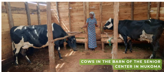
COWS IN THE BARN OF THE SENIOR CENTER IN MUKOMA

A cow provides milk, fertilizer, and income. But it also symbolizes new life after destruction. Particularly moving is how livestock builds bridges of reconciliation: survivors give animals to families connected to the genocide, turning aid into a visible expression of forgiveness.