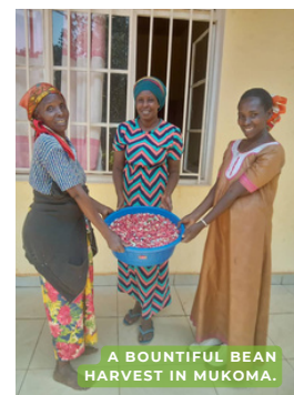
A BOUNTIFUL BEAN HARVEST IN MUKOMA.