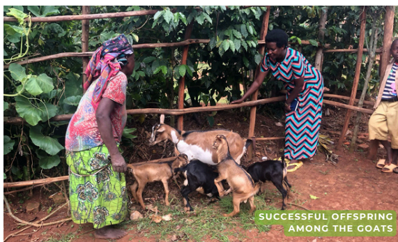
SUCCESSFUL OFFSPRING AMONG THE GOATS